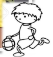
photo of the week